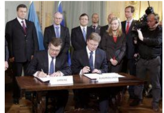
Signing ceremony during the November EU-Ukraine meeting

All parties are hoping that Ukraine and the EU can come away from the February meeting with progress made on enhancing the Ukraine-EU relationship.